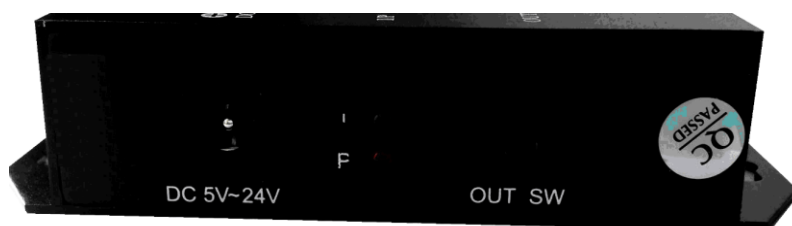
Left pannel : DC power supply, LED: I/P