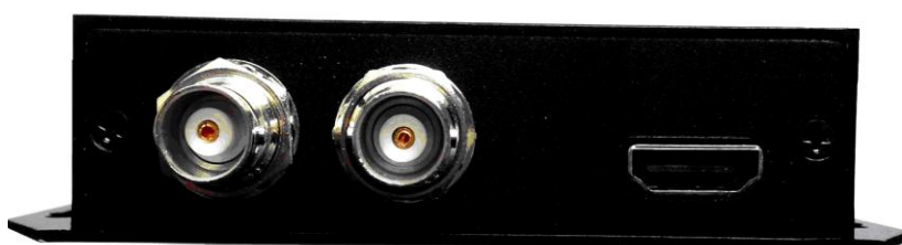
Right panel : AHD in, AHD loop out , HDMI out