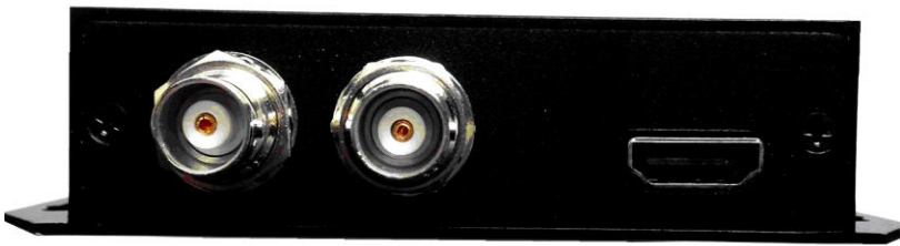
Right panel : AHD in, AHD loop out , HDMI out