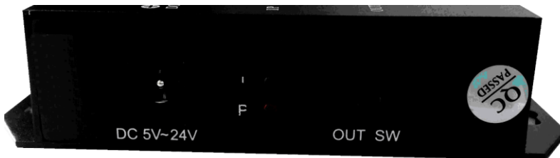
Left pannel : DC power supply